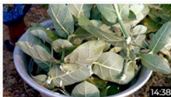
Herbal pest repellent