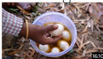
Converting chicken waste into fertiliz...