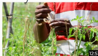
Staking tomato plants